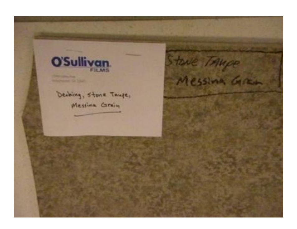
Photo No. 4 Specimen #4 Identification - Decking Stone Taupe Messina Grain