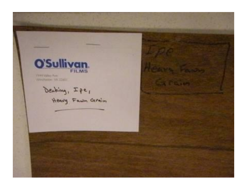
Photo No. 2 Specimen #2 Identification - Decking IPE Heavy Fawn Grain