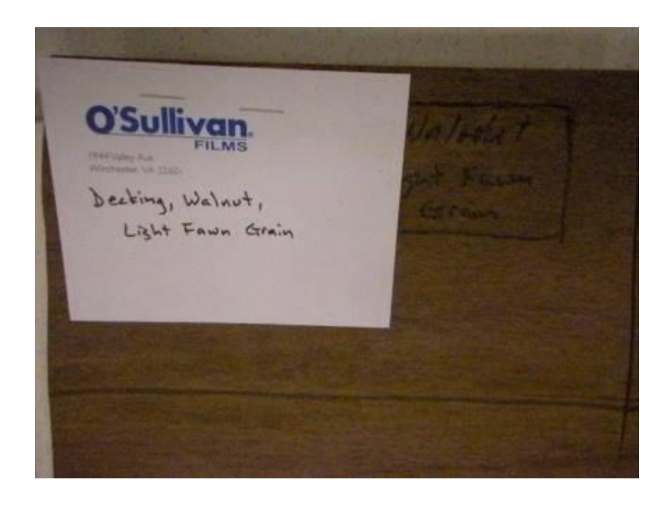
Photo No. 1 Specimen #1 Identification - Decking Walnut Light Fawn Grain