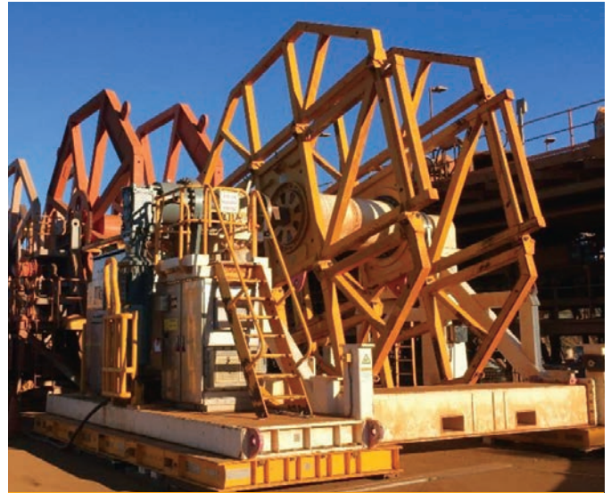
Continental 100t Belt Winder