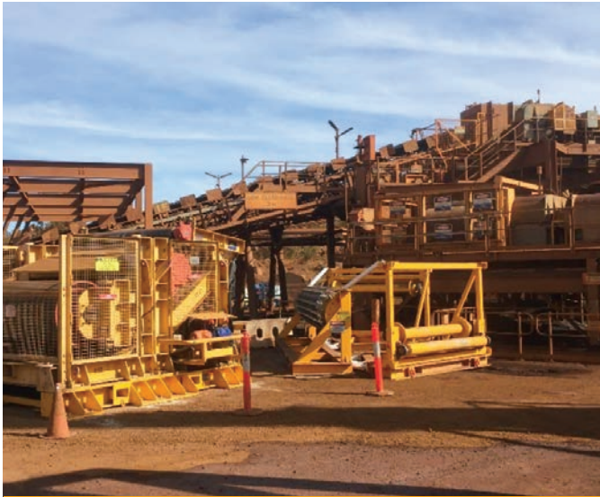
Belt Puller and 100° Turn Frame