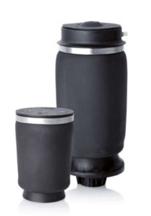
Sleeve air springs for axle suspension