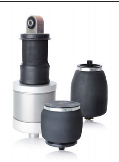
Sleeve air springs for cab suspension