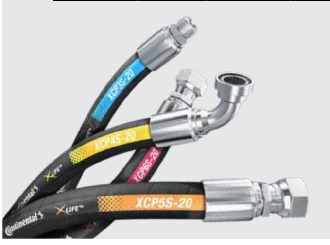
XCP5S Max. working pressure: 5100 psi, 35 MPa Min. burst pressure: 20400 psi, 140 MPa